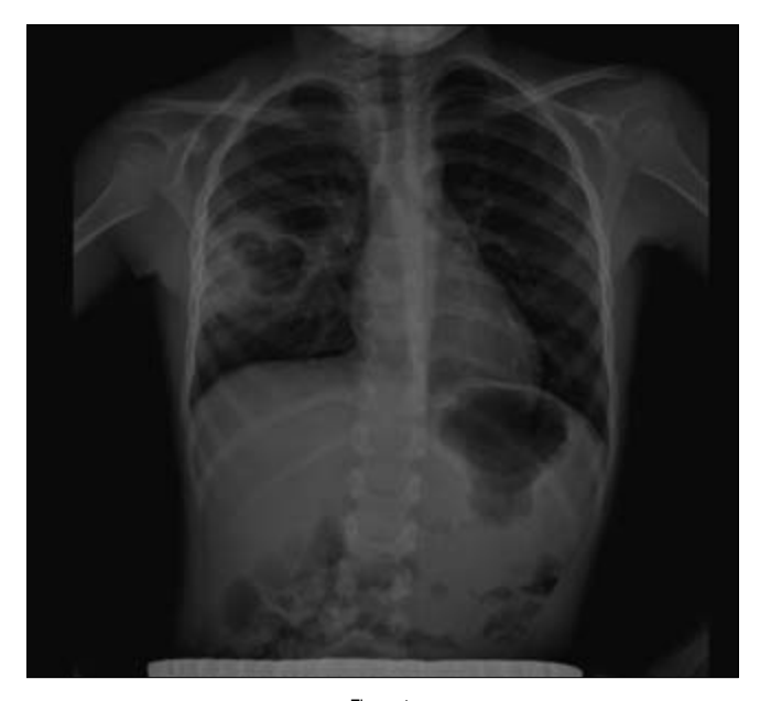
Figura 1. The chest radiograph demonstrates a large well-circumscribed consolidated lesion of the right upper lobe with an air fluid level

of the administration of antibiotics and, for this reason, the initial therapy was continued for 2 weeks and followed by oral clindamycin for another 2 weeks. For the rest of his stay in hospital the patient remained afebrile and was discharged after 2 weeks. X-ray control performed at 60 days showed normalization of the image pulmonary.