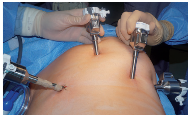
Figure 2. Four 8 mm-ports were advanced into the thorax after a right lateral decubitus was achieved.

BH represents a rare entity in the adult population. Its actual incidence, the relationship between its presence and symptoms and therefore indications for surgery are not clear even though the majority of authors, being aware of the possible severe complications, recommend surgical correction in all cases. The use of thoracoscopy is a safe surgical approach in an elective environment with low morbidity and shorter hospital stay and therefore surgeons familiar with these techniques should consider a minimally invasive approach when treating patients with BH. Furthermore the use of robot-assistance to thoracoscopy could facilitate surgeons in the future to achieve correction.