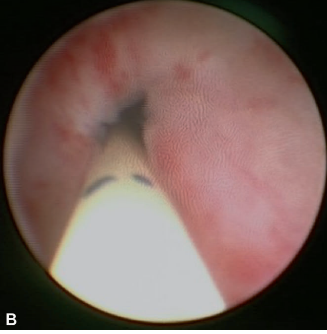
Figure 2. A) At the start of the procedure a cystoscopy was performed showing the entrance of the diverticulum on the posterior urethra; B) during the cystoscopy a ureteral catheter was placed into the Müllerian duct remnant to aid in identification during dissection.