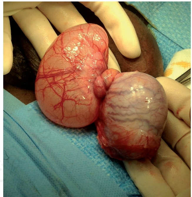
Figure 2. Large cystic mass (5x4 cm) of the head of epididymis twisted for 720° degrees with normal testis.

The incidence of ECs in children ranges from 5% to 20%. Their nature (degenerative or result of endocrine-disrupting agents acting