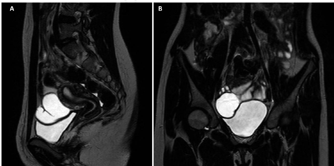
Figure 3. Case 2: A) transverse and B) sagittal section of T2W-MRI scan of right fluid-filled S-shaped Fallopian tube.